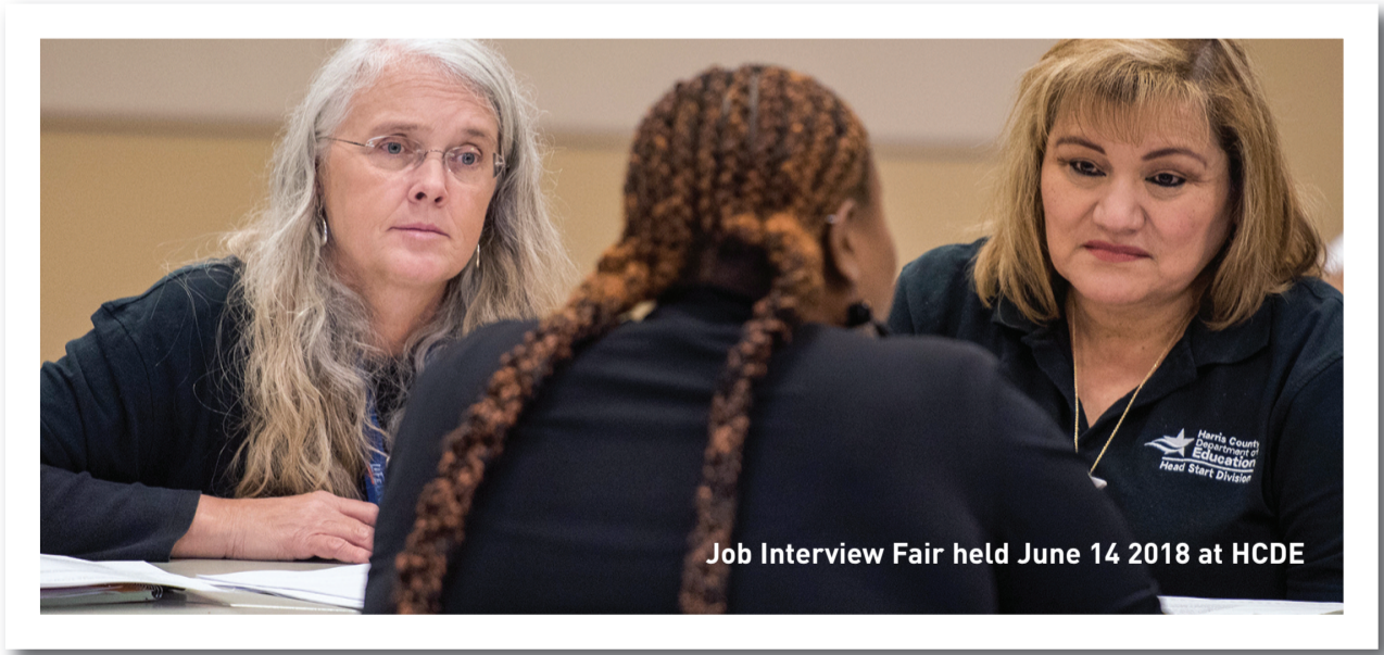
Job Interview Fair held June 14 2018 at HCDE